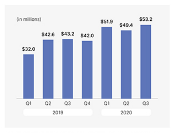
Adjusted EBITDA and Adjusted EBITDA Margin are non-GAAP financial measures and are presented for supplemental informational purposes only. Refer to the Non-GAAP financial measures section below for definitions, additional information, and a reconciliation to the most directly comparable GAAP measures.

On a quarter-over-quarter basis, Adjusted EBITDA Margin decreased 220 basis points, primarily due to an increase in advertising spend. After reducing advertising spend in certain channels in Q2 2020 due to the impact of the COVID-19 pandemic as many consumers avoided visiting healthcare professionals and pharmacies in-person, we increased our advertising spend in Q3 as more consumers resumed their interaction with the healthcare system. We will continue to evaluate the impact of the COVID-19 pandemic on our business and actively manage our consumer acquisition spending accordingly.